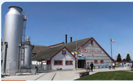
Gulf of Georgia Cannery Museum

G&F Financial Group commends the Society’s efforts to preserve and share their local history. We are proud to have the Gulf of Georgia Cannery Society as our member.