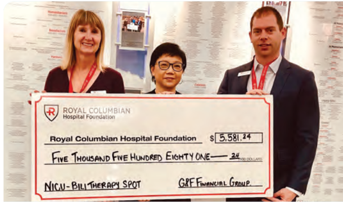
Royal Columbian Hospital Foundation cheque presentation

community partners, charity groups, cultural and sports organizations, and students. We supported 20 organizations, investing in a variety of projects that empowered and uplifted people. Recipients included BC Children's Hospital Foundation, Royal Columbian Hospital Foundation, Easter Seals House Society, YWCA Metro Vancouver, and The Centre for Child Development—organizations creating a significant and positive effect in the province. In December 2019, we reached a significant milestone, raising $1 million for the United Way of the Lower Mainland since we started our fundraising efforts in 2001. This is of particular importance to G&F and our employees as we believe strongly in the impact the United Way has in Metro Vancouver.