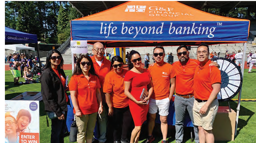
Supporting the Canucks Autism Network at the Rubber Ducky Race