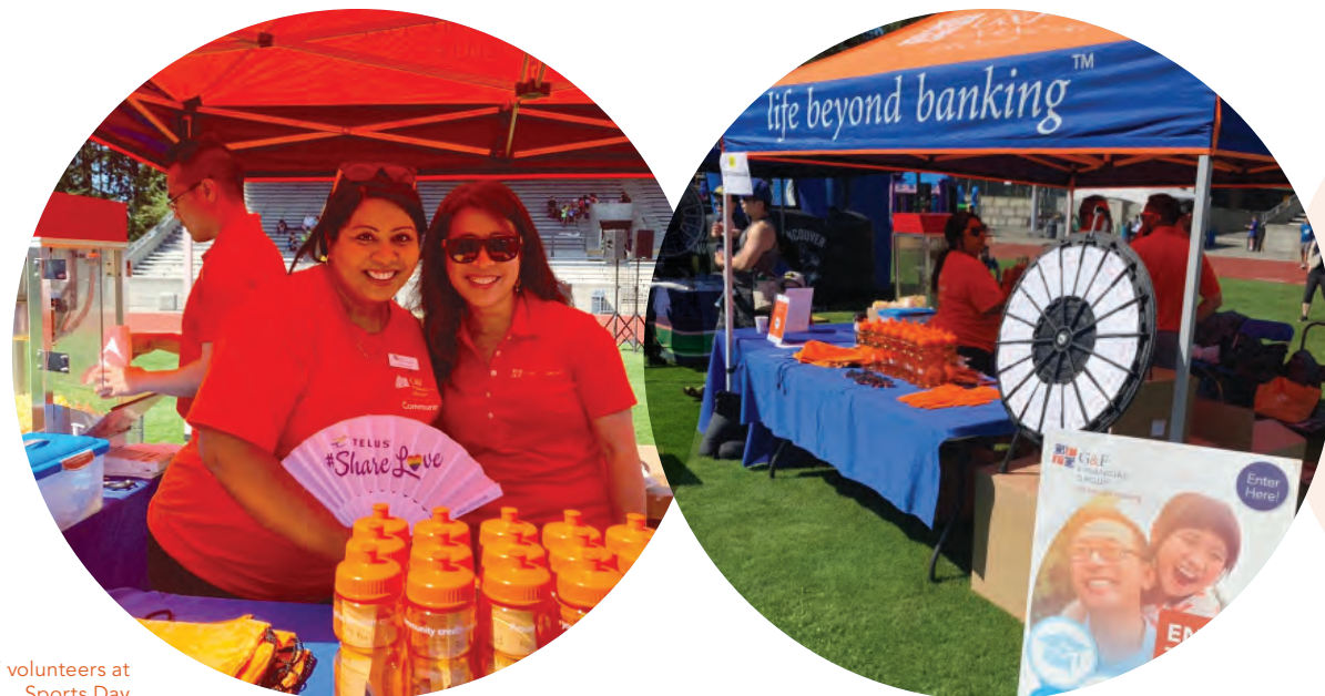
G&F volunteers at Sports Day