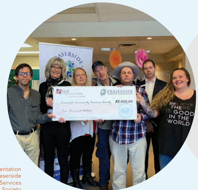
Cheque presentation to Fraserside Community Services Society