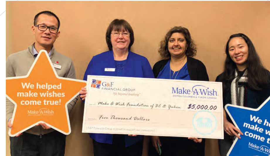
Make A Wish cheque presentation

Credit Unions are Helping Here Map of Giving 2012-2019